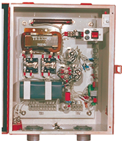
Table 6: ICC Equipment Data

Each flasher unit is controlled by an individual control cabinet, which houses triggering circuits, terminal blocks, and lightning arrestors. A safety interlock switch is incorporated into the enclosure to discharge the high-voltage circuitry when the cabinet door is opened.