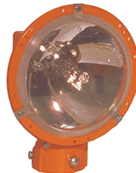
Table 3: Flash Head Unit Equipment Data

Each elevated flash head assembly consists of a flashing light head, which houses a PAR-56 flashtube and a trigger transformer. A safety interlock switch is incorporated in the flash head. It works in conjunction with the individual control cabinet (ICC) interlock switch to discharge the voltage across the flash lamp when either the ICC door is opened or the flashtube is removed.