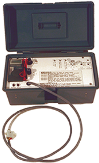
Table 9: Flasher Tester Equipment Data

The portable flasher tester is equipped with a test cable and plug, which connect to a socket in the ICC to monitor the operation of the flasher light unit. The flasher tester is capable of testing the power circuits and control signals from the master control unit to the ICC, and from the ICC to the flash head.