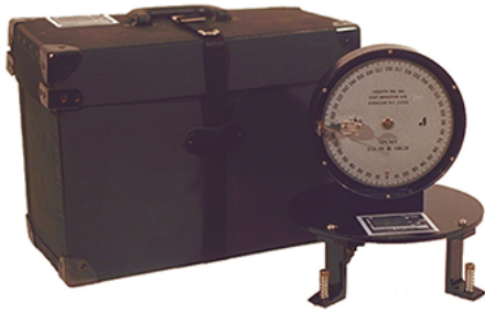
Table 7: Aiming Device Equipment Data