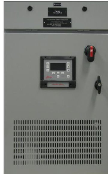
Fig. 1 30 kW Regulator in 24" wide Switchgear Cell