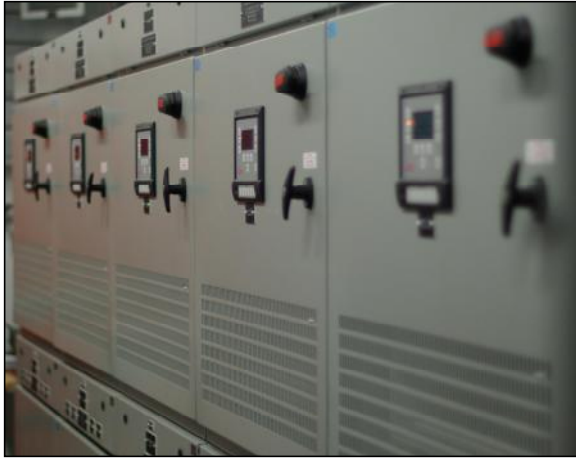
Fig. 2 Switchgear Lineup of 30KW CCRs